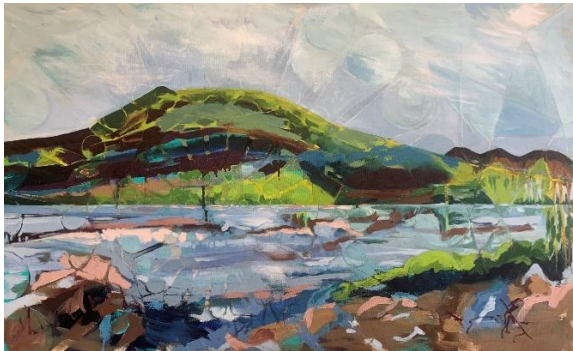
RETREATING WATERS OIL ON HAND STRETCHED CANVAS 80cms x 129cms

The use of geometry, in particular geometric pattern, is something that has occurred periodically in Helen's art work. This exhibition shows how this has now become more focussed as she begins to explore the space in between a landscape and introduces a spiritual thinking into the relationship between people and nature.